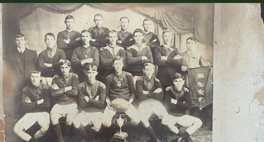
Rovers Jr. Football Team, 1905

Established in 1987, the Carterton District Historical Society (CDHS) comprises of a collection of enthusiasts who are interested in uncovering, preserving and sharing the history of Carterton – it's places, buildings, people, businesses, social & sporting groups and events. Our archive holds records of local historical photographs, memorabilia, regional maps, artefacts, histories of individual local businesses, school rolls, churches, Clareville cemetery records and the history of Carterton's early European settlers.