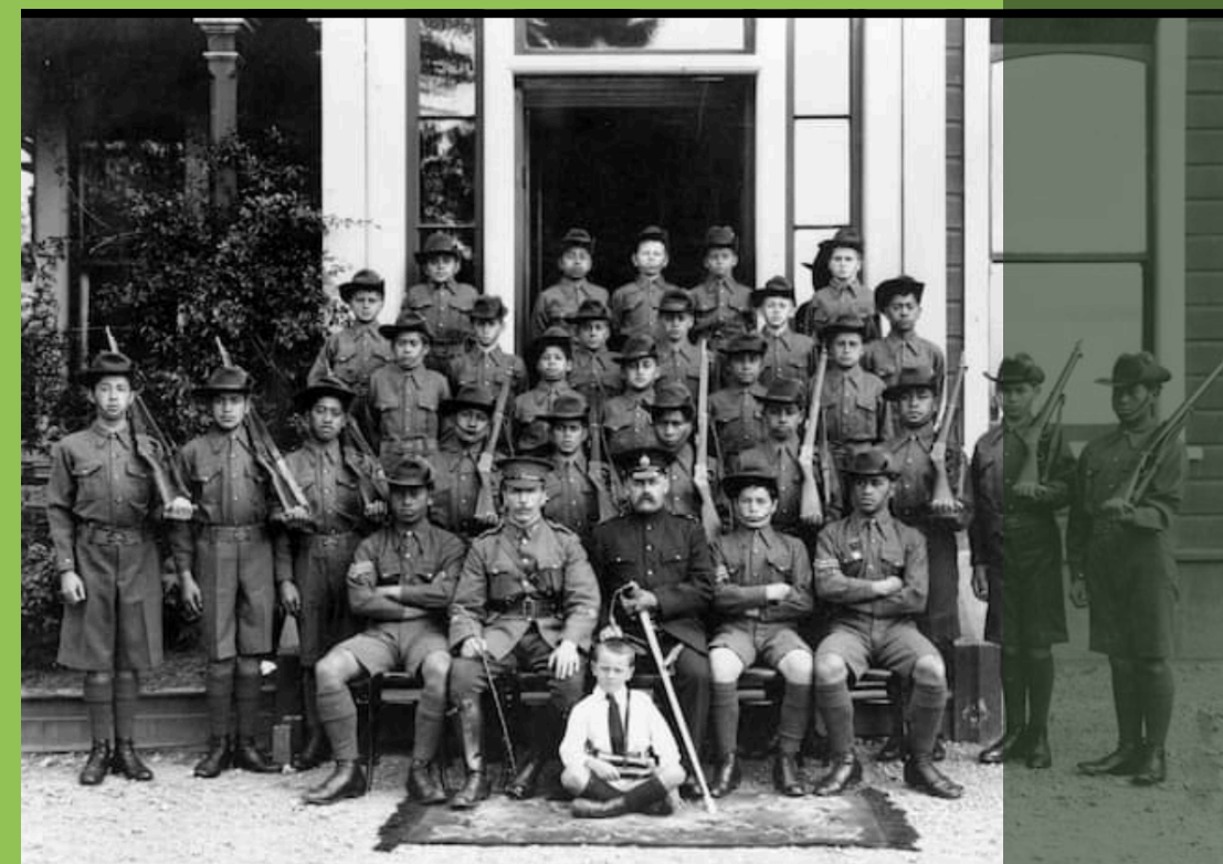
School Cadets - Hukurangi College, Clareville, 1900 - 1920