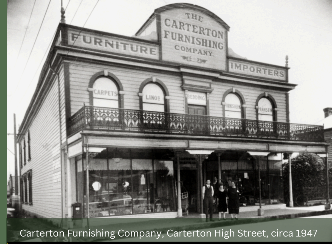
Carterton Furnishing Company, Carterton High Street, circa 1947