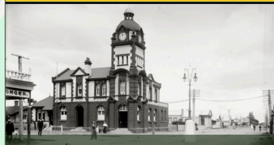
Carterton Post Office, Carterton High Street, 1913

TO DISCOVER, UNDERSTAND, RESPECT, VALUE AND SHARE OUR COMMUNITY'S YESTERDAYS