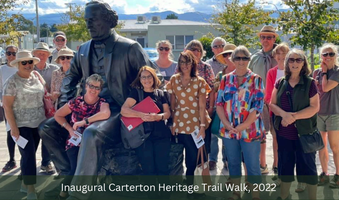
Inaugural Carterton Heritage Trail Walk, 2022