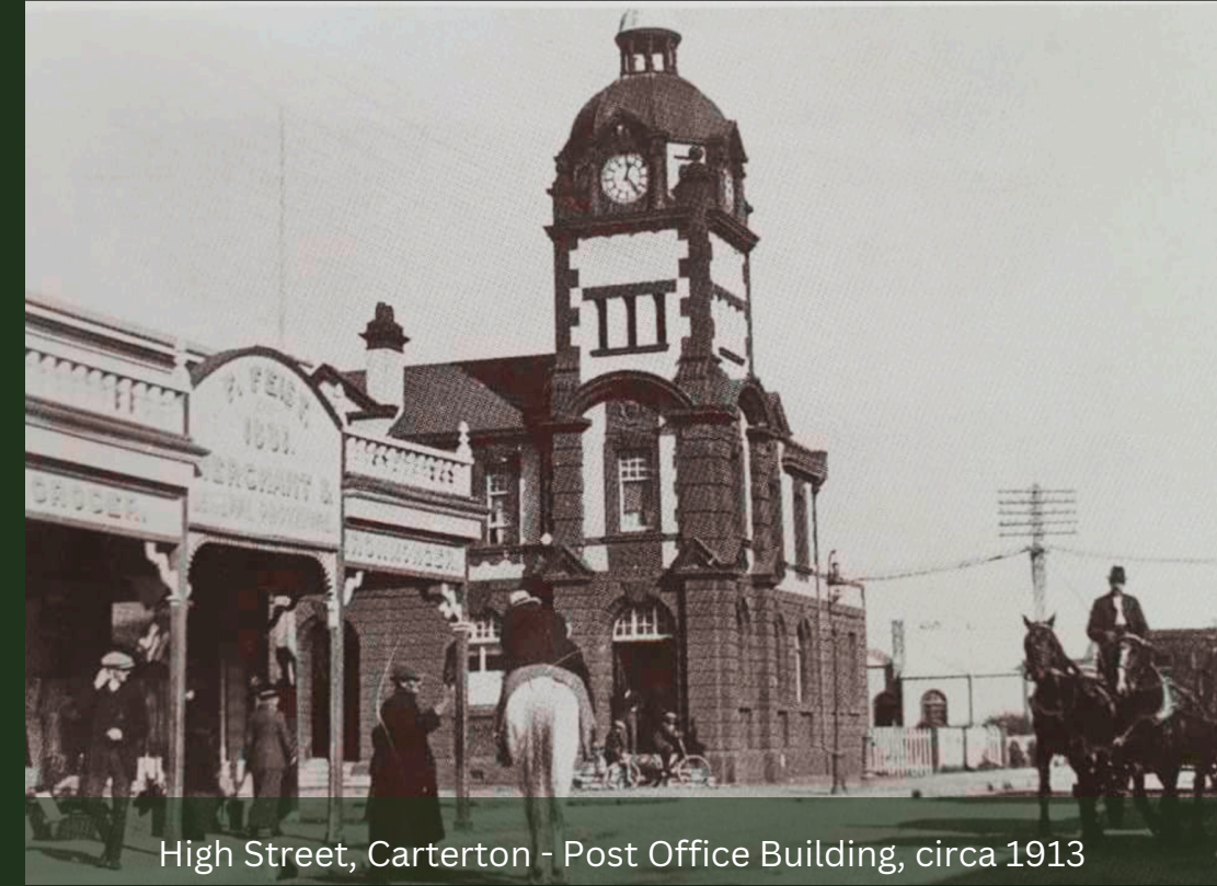
High Street, Carterton - Post Office Building, circa 1913