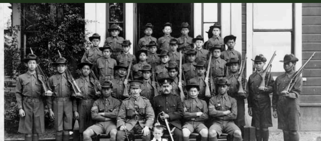
School Cadets - Hikurangi College, Clareville, 1900 - 1920

Established in 1987, the Carterton District Historical Society (CDHS) comprises of a collection of enthusiasts who are interested in uncovering, preserving and sharing the history of Carterton – it's places, buildings, people, businesses, social & sporting groups and events. Our archive holds records of local historical photographs, memorabilia, regional maps, artefacts, histories of individual local businesses, school rolls, churches, Clareville cemetery records and the history of Carterton's early European settlers.