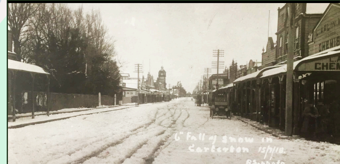
'6" Fall of Snow in Carterton', Carterton High Street, 1918

TO DISCOVER, UNDERSTAND, RESPECT, VALUE AND SHARE OUR COMMUNITY'S YESTERDAYS