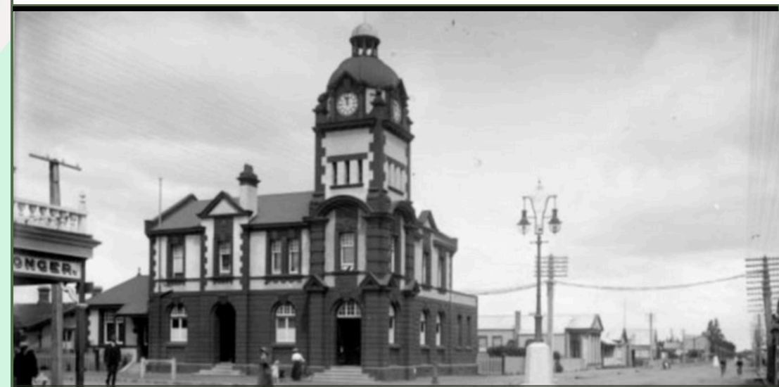
Carterton Post Office, Carterton High Street, 1913

TO DISCOVER, UNDERSTAND, RESPECT, VALUE AND SHARE OUR COMMUNITY'S YESTERDAYS