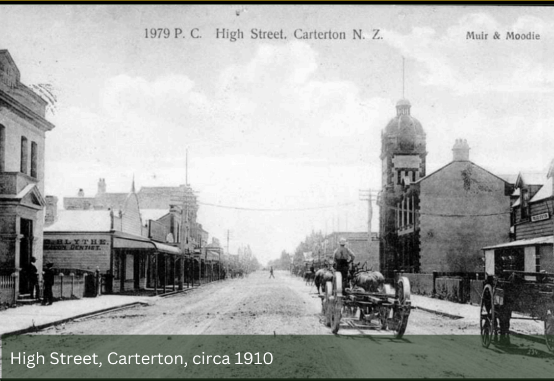
High Street, Carterton, circa 1910

The Carterton District Historical Society looks forward to partnering with your business.