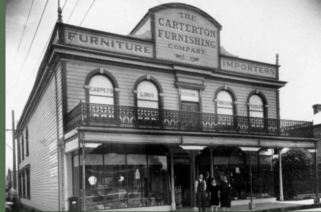
Carterton Furnishing Company, Carterton High Street, circa 1947