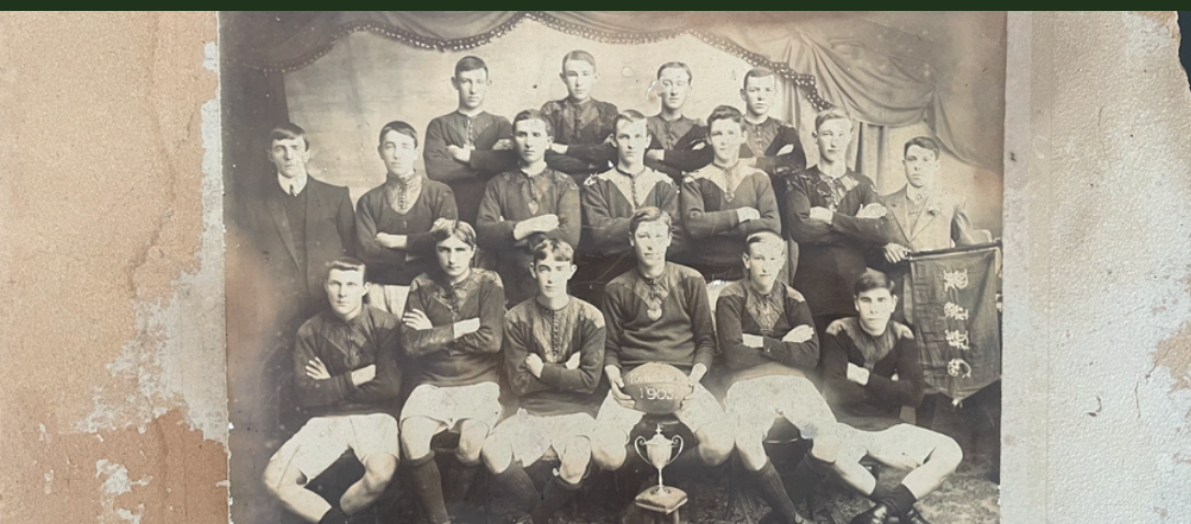
Rovers Jr. Football Team, 1905

Established in 1987, the Carterton District Historical Society (CDHS) comprises of a collection of enthusiasts who are interested in uncovering, preserving and sharing the history of Carterton – it's places, buildings, people, businesses, social & sporting groups and events. Our archive holds records of local historical photographs, memorabilia, regional maps, artefacts, histories of individual local businesses, school rolls, churches, Clareville cemetery records and the history of Carterton's early European settlers.