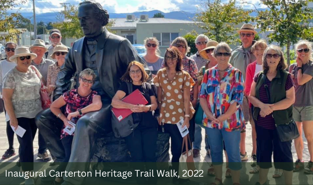
Inaugural Carterton Heritage Trail Walk, 2022